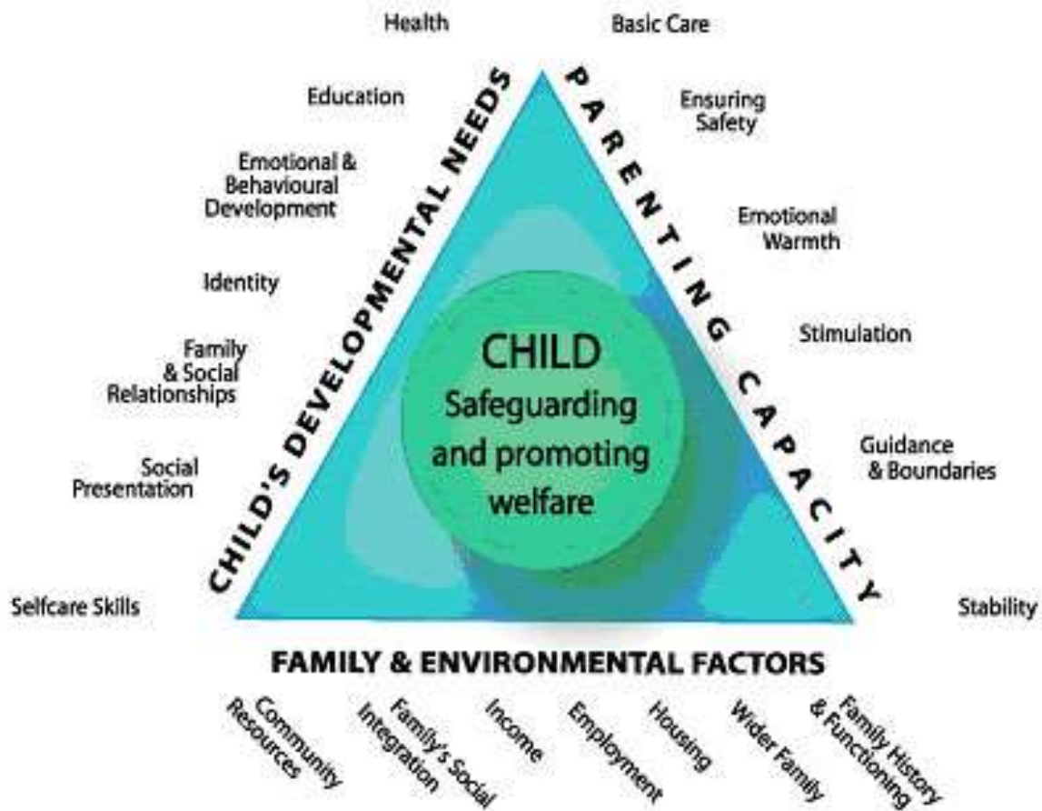
Figure 1 – The Assessment Framework 56